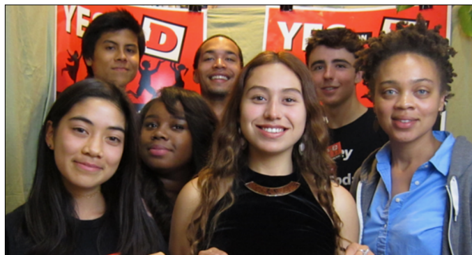
Berkeley Vs. Big Soda Campaign Workers