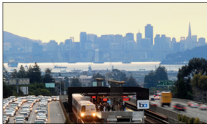
Metropolitan Transportation Commission

The annual Bay Area League Day hosted by LWV Bay Area on February 6, 2016 in San Pablo revealed recent developments and pressing concerns in